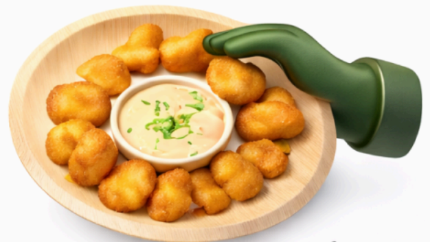
Palm Leaf Plates